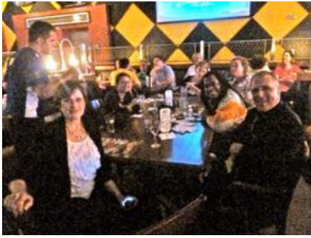
NPMGH Chapter Gathers with Cardinal DiNardo