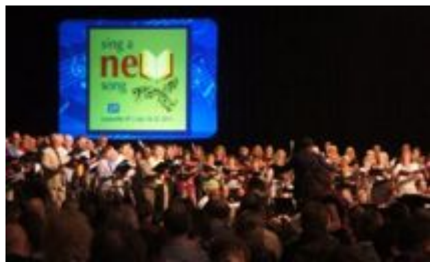
Opening Event boasts over 3,400 attendees