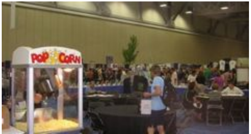
Busy Exhibit Hall