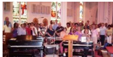
From a "Bring Your Own Octavo" gathering of Richmond Diocese Chapter