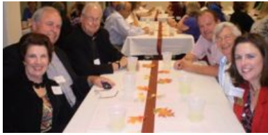
Chapter members and friends at pose for a photo at the 2010 Musician's Convocation Banquet

perhaps one of the best meetings we've had in our 30 year history.