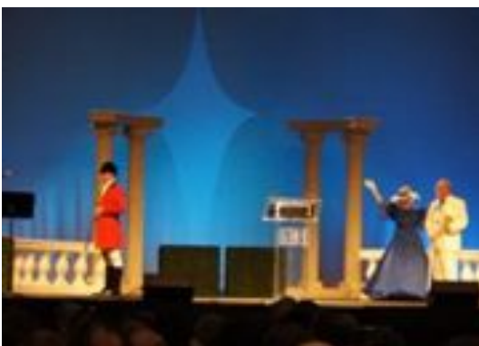
Louisville welcomes NPM with a Bugle Call

The Louisville Chapter did a wonderful job of organizing, their hospitality was truly full of southern charm, and the venue was suitable, easy to get around, and filled with plenty of good eats, treats and things to do. ( for those that had time between concerts, sessions, workshops, exhibits, etc!) The 2012 NPM Convention will be in PITTSBURGH, PA! 2013 returns to Washington DC and rumors are that 2014 may just make it to San Antonio, Texas! Woohoo!