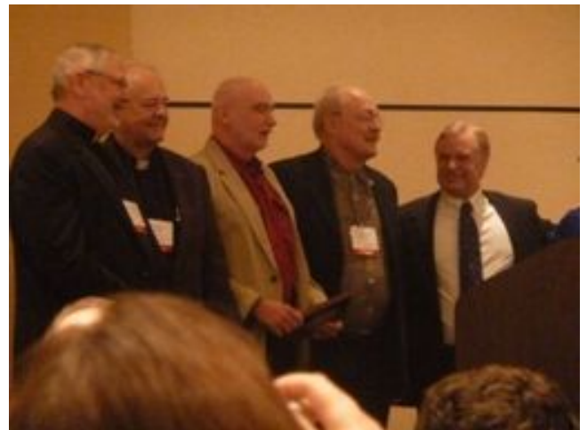
St. Louis Jesuits Receive the Jubilate Deo Award