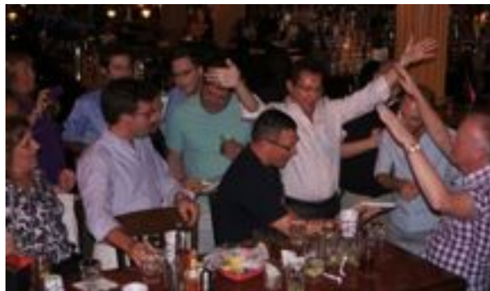
Late night rendering of "My Old Kentucky Home"