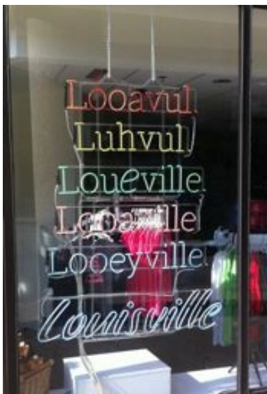
Just how DO you say it??